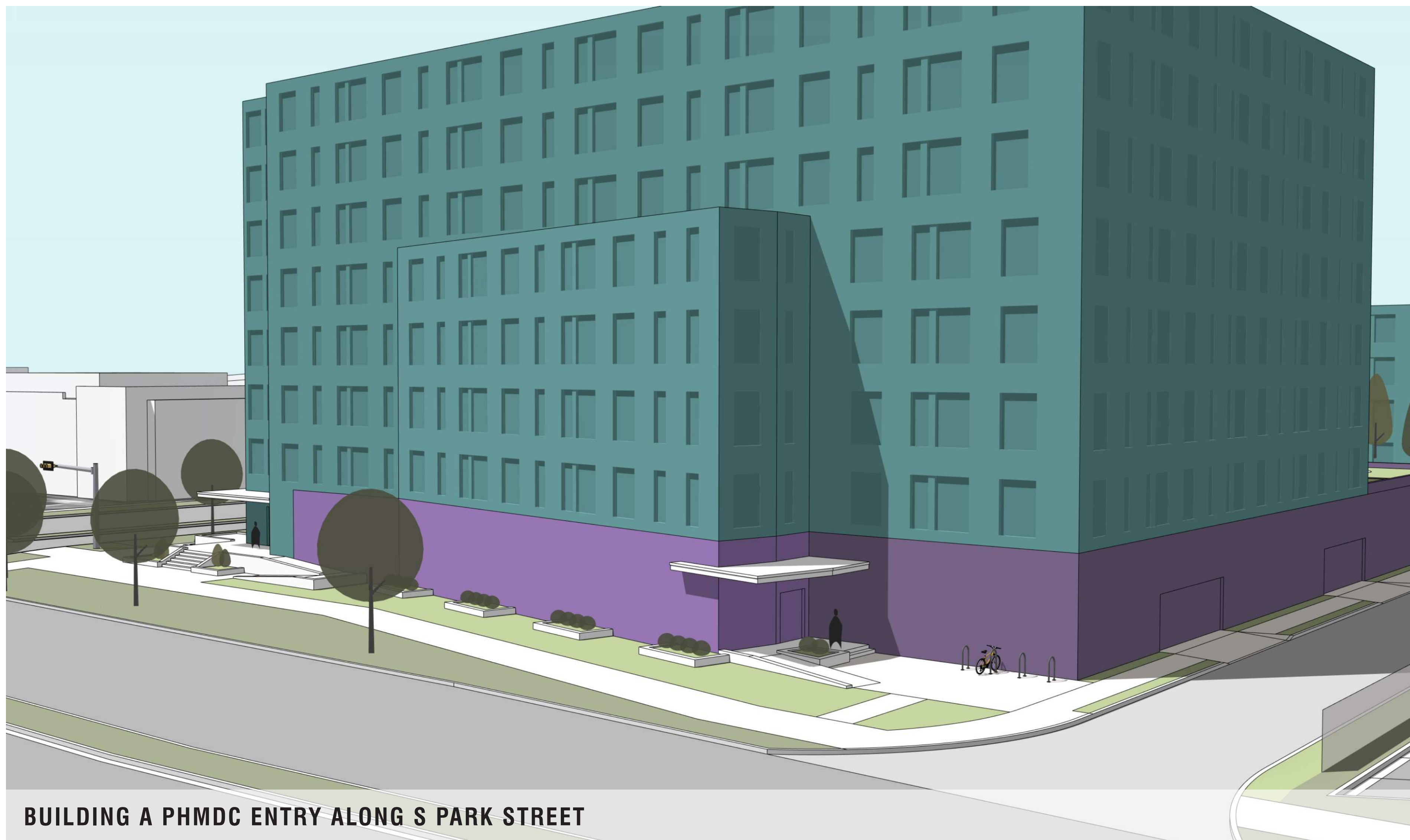
BUILDING A PHMDC ENTRY ALONG S PARK STREET