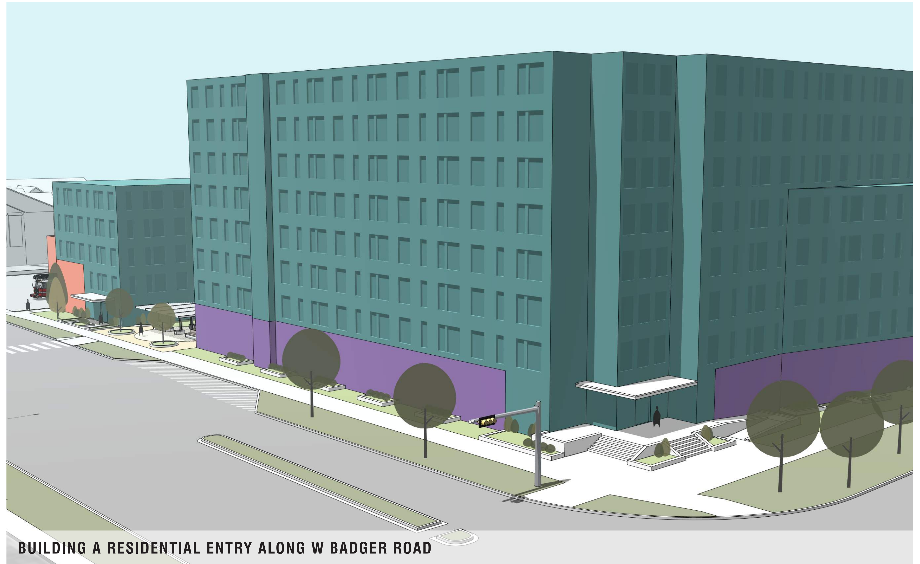
BUILDING A RESIDENTIAL ENTRY ALONG W BADGER ROAD